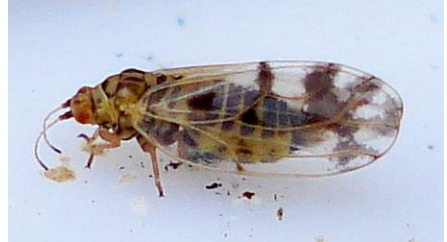
Craspedolepta nebulosa .

A tiny bug around 3mm long is not the sort of thing you would expect a non-specialist to recognise, but this one is an exception. It lives on Rose-bay Willow-herb, and has a unique star pattern on the wing. Look at the young tops of the plants in June, before the flowers open. The bugs can be detected with the naked eye, and a lens will show the wing pattern.