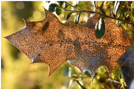
Holly Speckle Trochila ilicina .

This fungus only grows on dead (brown) leaves of Holly. Its appearance varies depending on the state of maturity, but it is easily recognised from the distinct fine (<1mm diameter) dark speckling on the upper side of the leaf only. The speckles (spore-producing structures) are first closed, then open by a lid to expose the olive spore-mass, and finally appear as dry black, shiny depressions in the leaf, with a slightly raised lip.