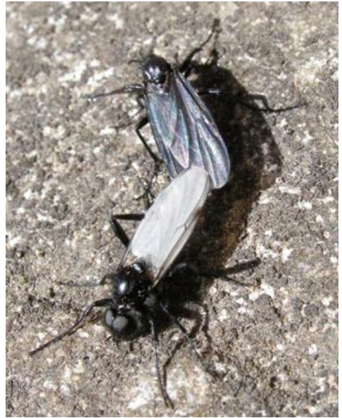
St Mark's Fly Bibio marci pair in cop., male below.

It flies in a very short season, mostly in May with a few in late April and early June. Swarms of males are conspicuous on mild calm days.