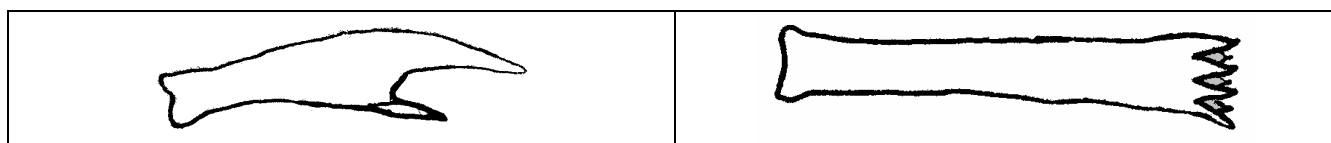
Front tibia of Bibio (L) and Dilophus .